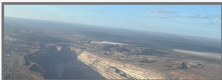
Kalgoorlie, Western Australia