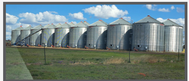
Darling Downs, Queensland