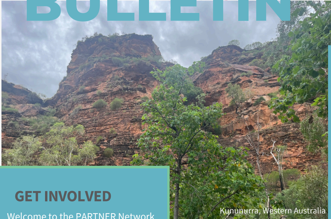
Kununurra, Western Australia